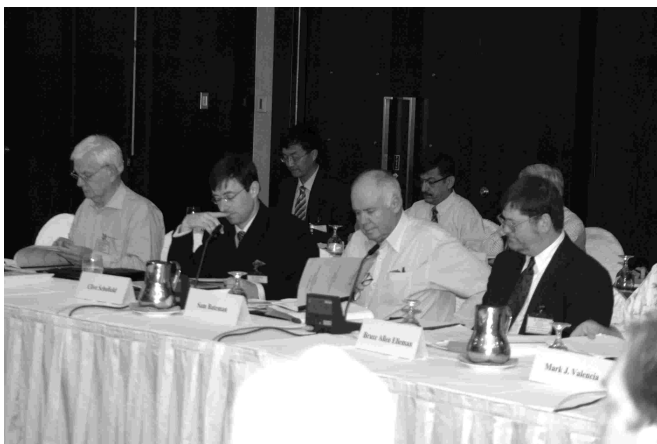
SPEAKERS FOR SESSION 1

There were comments from conference participants that India's and Japan's responses to China's naval development were not mentioned in the presentations. The responses to the question were for one, China has at times not been very specific or clear in its views on the region. Next, China's military developments