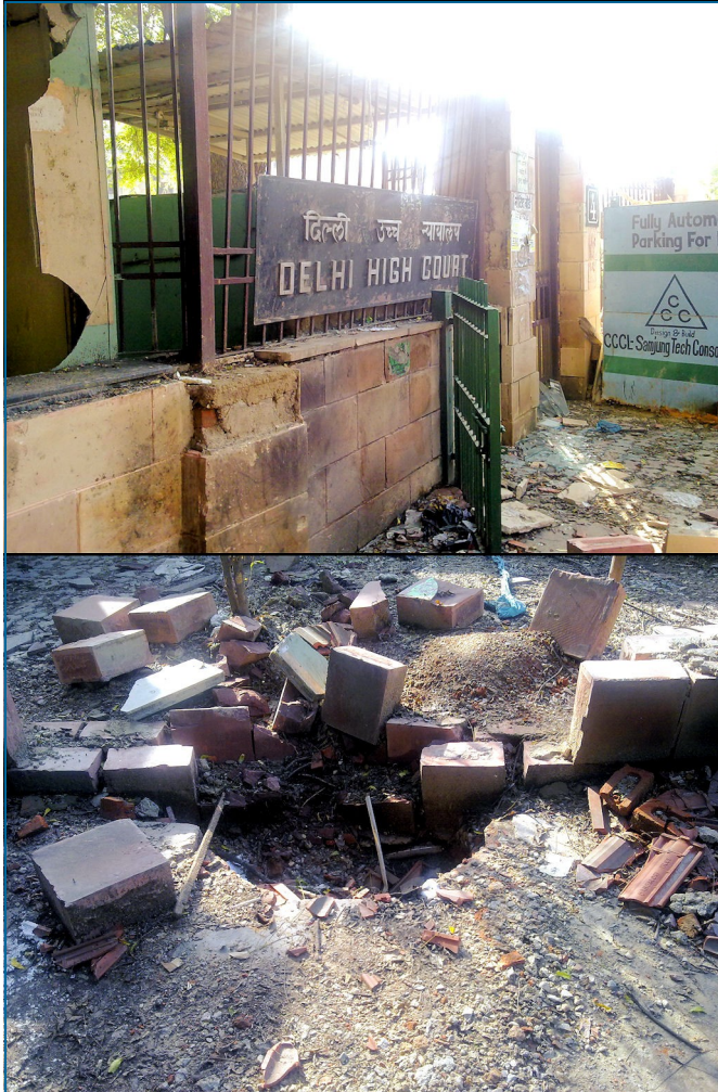
September 2011 photos taken of the crater caused by the bomb planted in front of the Delhi High Court reception area.