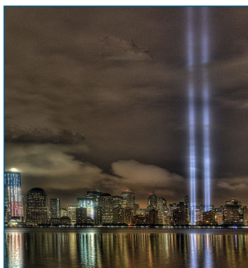
The "Tribute in Light" was a memorial built in New York City to commemorate the 9/11 attacks.

A decade after the 9/11 attacks the terrorist threat has evolved and the jihadist movement has undergone some significant changes. There is reason to believe that these changes could spell the beginning of the end of the jihadist movement.