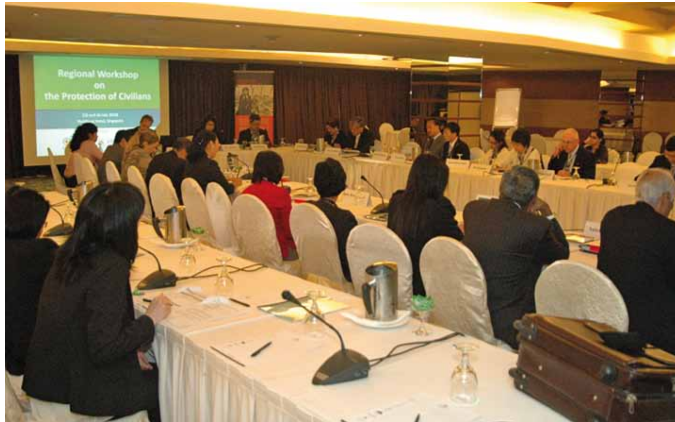
Discussion in progress at the ParkRoyal Hotel

T he ASEAN region faces many types of humanitarian emergencies and crisis situations, ranging from internal conflicts to natural disasters. Humanitarian emergencies that arise from natural disasters, like Typhoon Ketsana in the Philippines or conflicts and post-conflict challenges in Indonesia, result in widespread displacement, increased gender-based violence and unanticipated health and security challenges. Consequently, it becomes especially important to assess the protection of populations during this period.