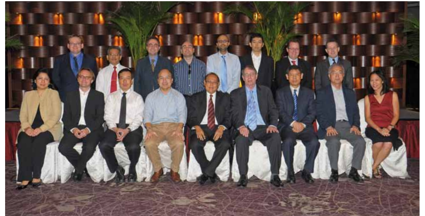
Speakers and participants at the conference

A conference on “Regional Security Cooperation” was hosted by the Multilateralism and Regionalism Programme of RSIS on 19–20 July 2010. Funded by The John D. and Catherine T. MacArthur Foundation under its Asia Security Initiative, the conference examined the function and relevance of the Association of Southeast Asian Nations (ASEAN) in East Asia’s emerging institutional security landscape.