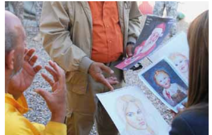
An Iraqi Detainee who has finished the Islamic Discussion Program and is now enrolled in the Art Program discusses his reasoning behind his artwork: "We are all brothers. We must respect everyone, where they come from, what they believe and what they celebrate."