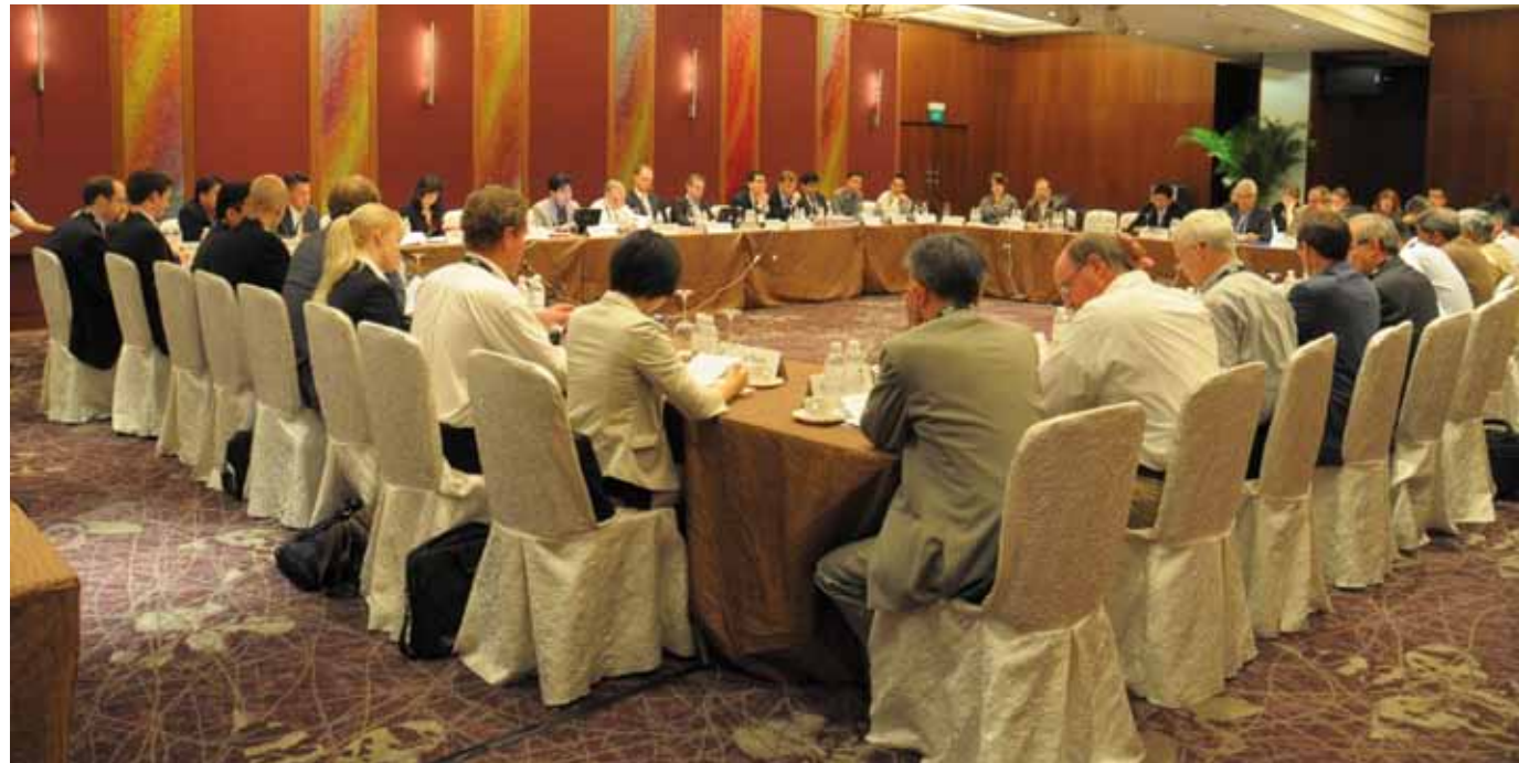
Participants at the 11th CSCAP Study Group Meeting

R SIS hosted the Eleventh Meeting of the Council for Security Cooperation in the Asia Pacific (CSCAP) Study Group on “Countering the Proliferation of Weapons of Mass Destruction (WMD)” in Singapore on 3-4 July 2010. CSCAP is a forum of 21 countries in which government and non-government experts discuss a range of regional policy issues through specialized study groups. The WMD Study Group focuses on the proliferation of nuclear, biological and chemical weapons. Its primary mission is to develop a comprehensive Handbook on Preventing the Proliferation of Weapons of Mass Destruction in the Asia-Pacific . It meets biannually and works towards consensus on advice to governments on issues such as arms control and disarmament, nonproliferation efforts with respect to state as well as non-state actors, and regional threat perceptions and security-related developments.