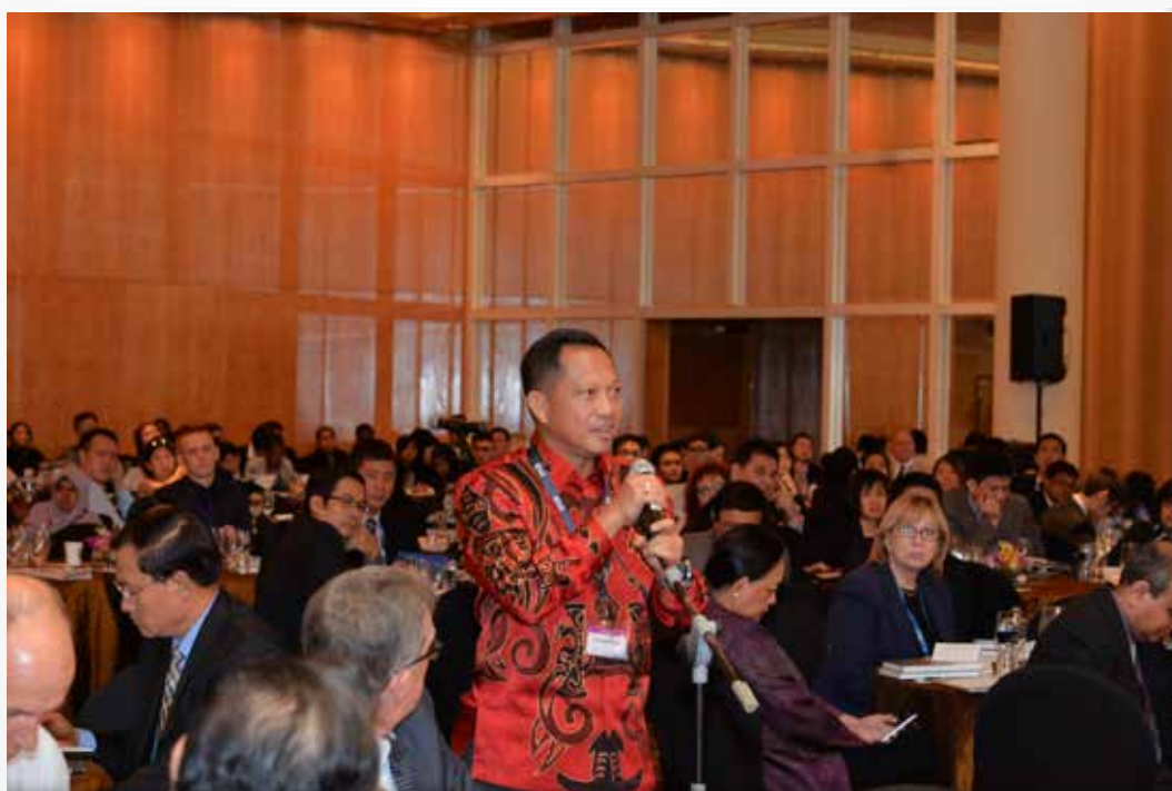
Dr Tito Karnavian, Jakarta Police Chief sharing his insights at the Symposium