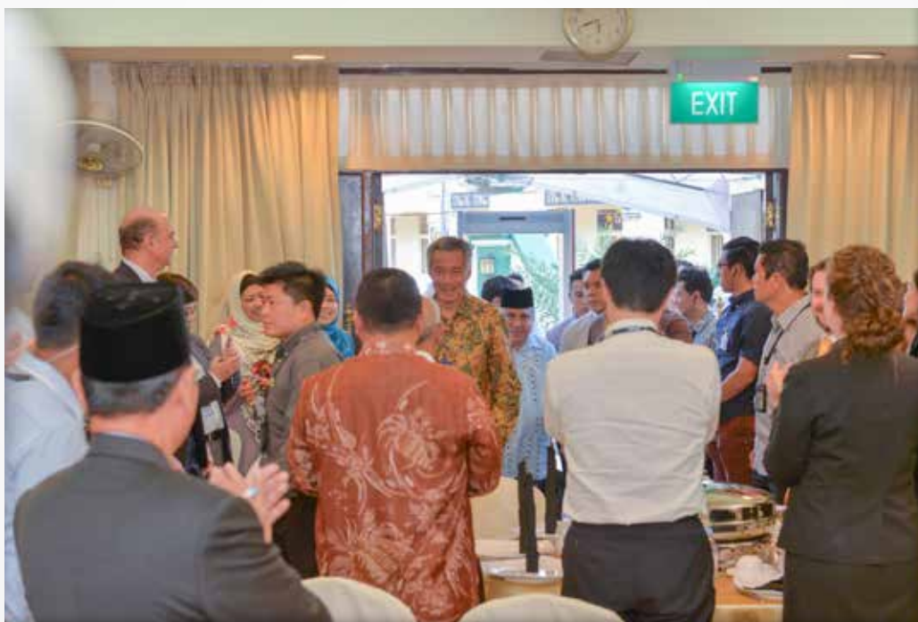
Arrival of PM Lee Hsien Loong at the Closing Dinner