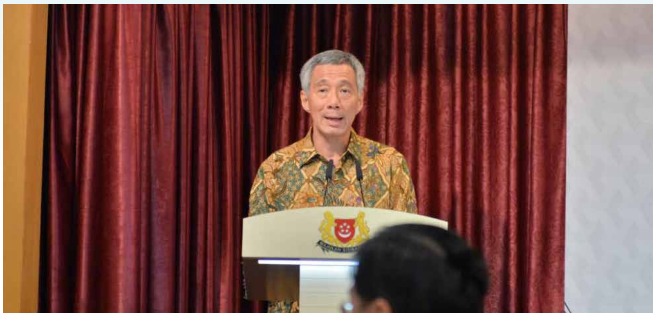
Mr Lee Hsien Loong Prime Minister of Singapore

Mr Lee Hsien Loong, Prime Minister of Singapore