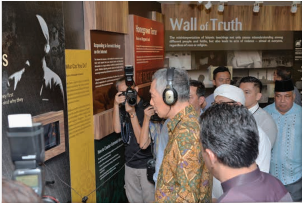
PM Lee Hsien Loong at the interactive section of the RRG Resource and Counselling Centre (RCC)