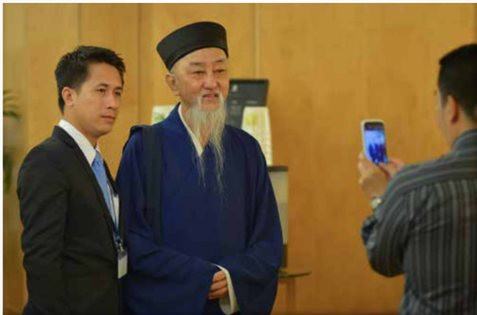
Representation from religious groups at the EAS Symposium