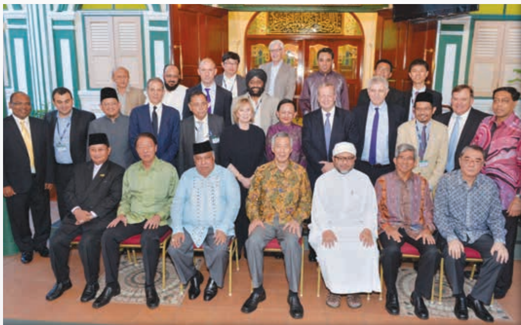
EAS Symposium speakers at the Khadijah Mosque