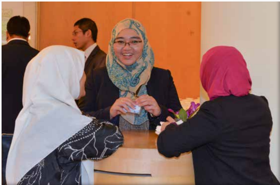
Networking among EAS Symposium participants during tea break