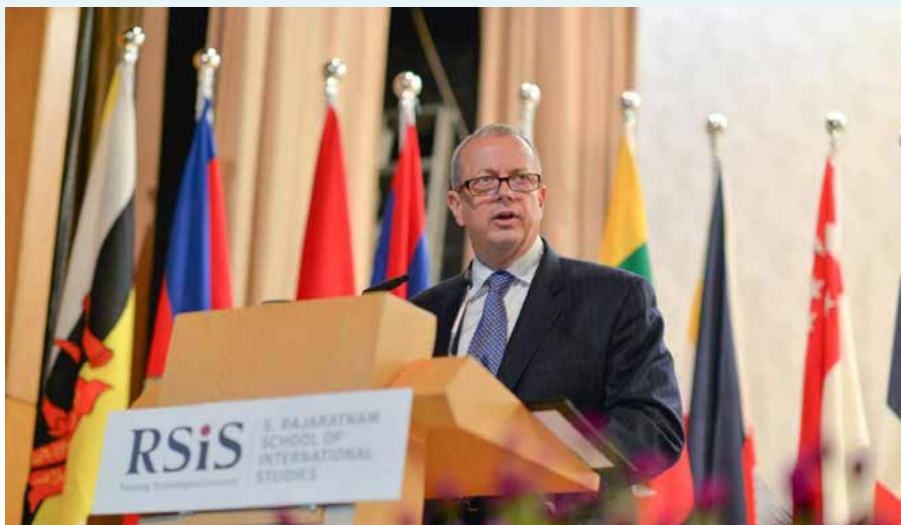
General John Allen Special Presidential Envoy for the Global Coalition to Counter ISIL, US

General John Allen began his presentation by commending Singapore's effort to de-radicalise and reintegrate extremist offenders back into the society. The trust and mutual respect among the government officials, civil society and Muslim leaders served as a model for General Allen of what was needed in a multicultural and multi-faith community. Singapore has also succeeded in showcasing what President Obama has emphasised – the need to diversify the approach in counter terrorism.