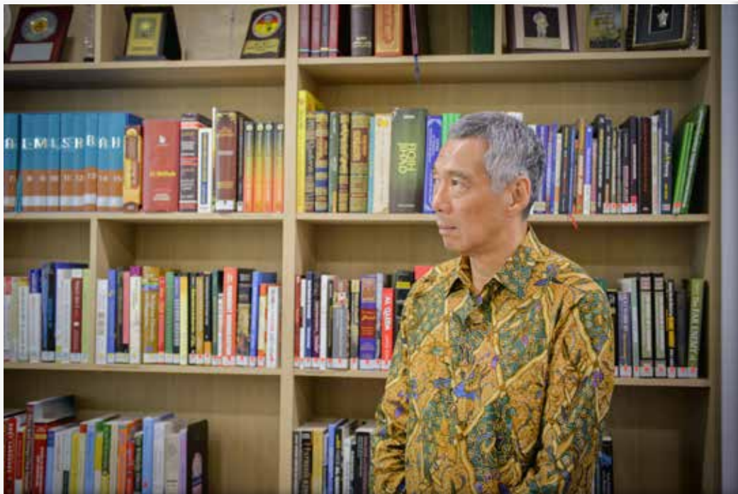
PM Lee Hsien Loong at the RRG Resource and Counselling Centre (RCC)