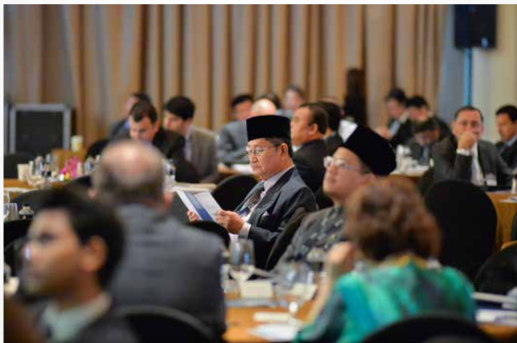
Brunei's Minister for Home Affairs Pehin Dato' Badaruddin Othman, a distinguished speaker at the EAS Symposium