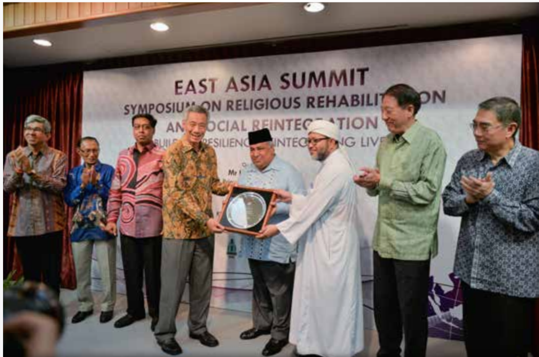
PM Lee Hsien Loong presented with a token of appreciation by the Co-Chairmen of the RRG