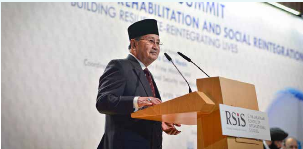
Pehin Dato Badaruddin Othman Minister for Home Affairs, Brunei Darussalam

Pehin Dato Badaruddin Othman explored the comprehensive definition of terrorism, its causes and effects, and ways to suppress the spread of terrorism through rehabilitation. Pehin Dato Badaruddin Othman began by highlighting the unfortunate situation today which is the linking of terrorism to Islam especially by the media. Consequently, this has caused a threat to not only security and public order, but to the jihadists themselves, when they seek 'rewards' based on misleading beliefs.