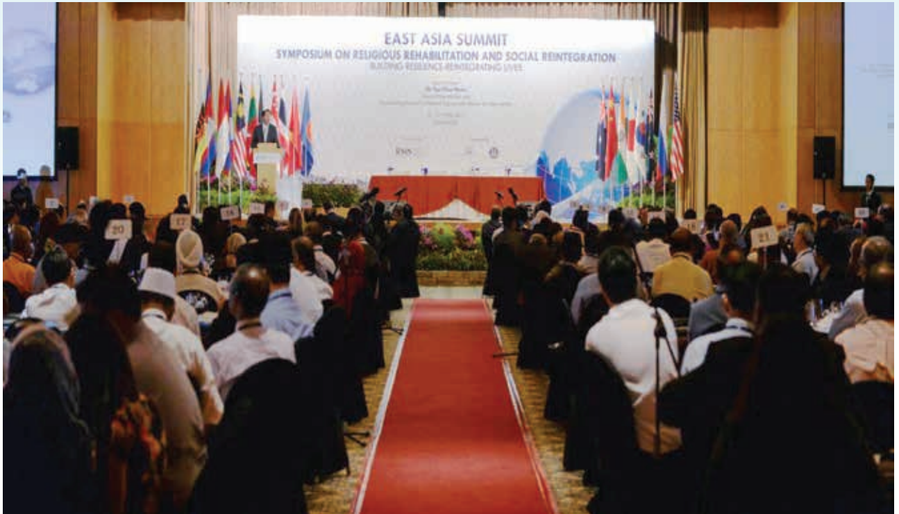
Participants at the East Asia Summit Symposium on Religious Rehabilitation and Social Reintegration included local and foreign panellists, participants and invited guests.

The East Asia Summit (EAS) Symposium on Religious Rehabilitation and Social Reintegration was convened by the International Centre for Political Violence and Terrorism Research, a specialist centre of the S. Rajaratnam School of International Studies at the Nanyang Technological University in Singapore. The EAS Symposium was supported by the Government of Singapore.