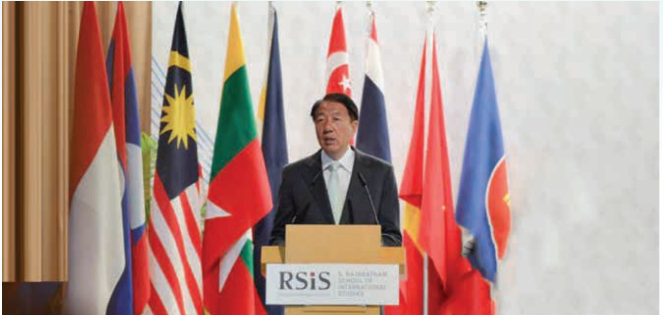
Mr Teo Chee Hean

Deputy Prime Minister of Singapore, Coordinating Minister for National Security and Minister for Home Affairs