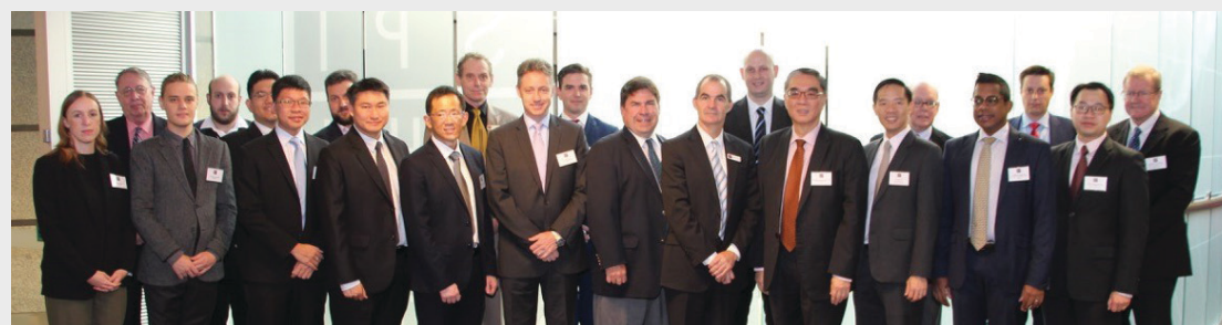
Participants of the ASPI-RSIS Track 1.5 Dialogue

Australia have invested heavily in counter-terrorism. The management of cyber-attacks, as well as the development of policy norms relating to cyber generally, has been an emerging concern for both governments. In closing, delegates from Singapore and Australia agreed that the dialogue had succeeded in identifying areas of mutual interest that could form the basis for future dialogue.