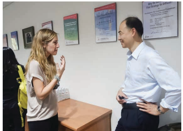
Environmentalist Ma Jun (right) with a participant before his seminar

Mr Ma spoke on how IPE uses innovative methods to transform environmental practices among China’s state agencies, businesses and the public. In the past decade, Mr Ma and IPE