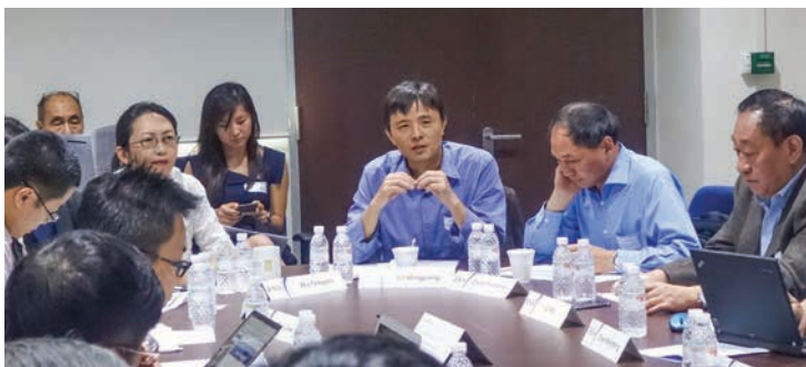
The group comprising China experts and scholars sharing their views on China's affairs