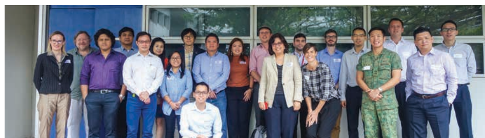
Participants of the HUMTECH Workshop

This workshop was the first event on humanitarian technology organised by NTS Centre’s Humanitarian Assistance and Disaster Relief (HADR) Programme. A vivid exchange of knowledge, ideas and opinions among leading actors of the region involved in humanitarian technology helped make this workshop a success.