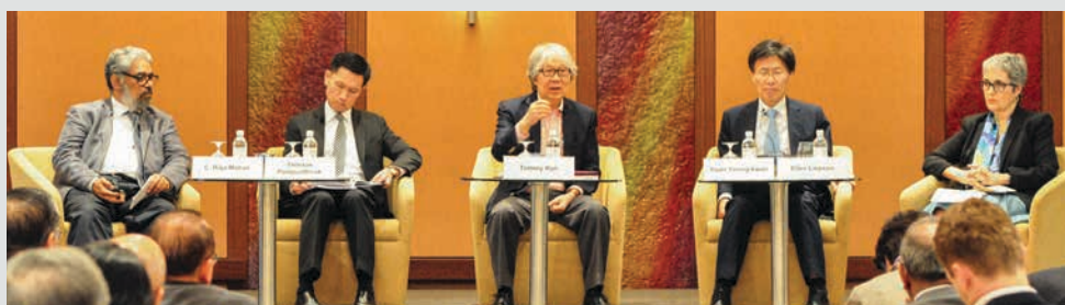
Professor Tommy Koh (centre) moderating the panel discussion