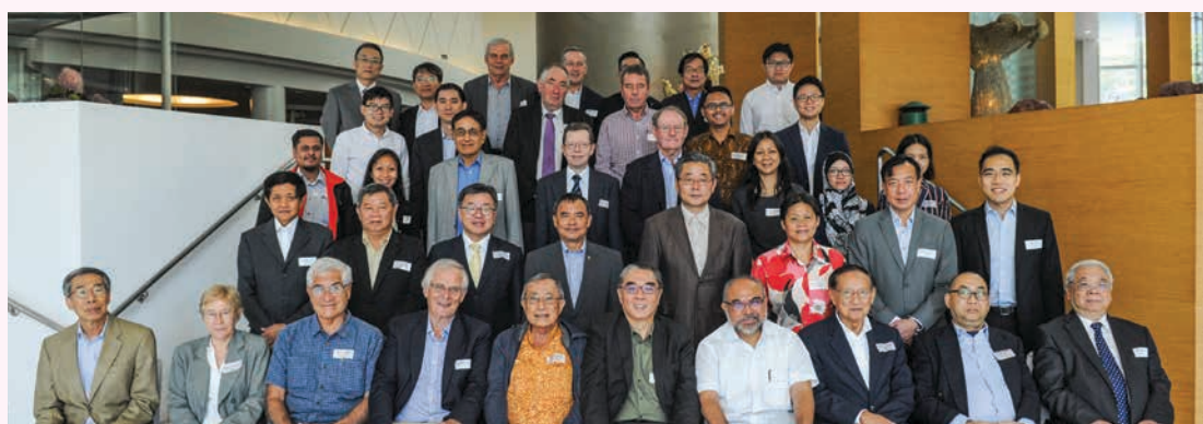
Participants at the CSCAP Retreat

architecture and that it is important for ASEAN to find ways to keep its unity intact to face future regional challenges. While there are some initial signs of the Trump administration’s policies towards Asia, these policies are still constantly evolving and it will take a few more months before clearer signals emerge from Washington D.C. ASEAN needs to show how it can remain relevant to the interests of the major powers in an increasingly transactional world.