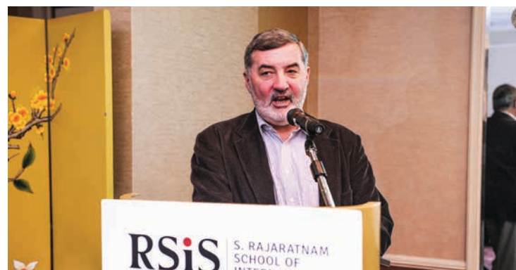
Professor Lord John Alderdice

During the one-week with RSIS, Lord Alderdice delivered two seminars on "Is Extremism Inherently Violent?" and "Building Cohesion in Intractably Divided Societies: Some Personal Reflections".